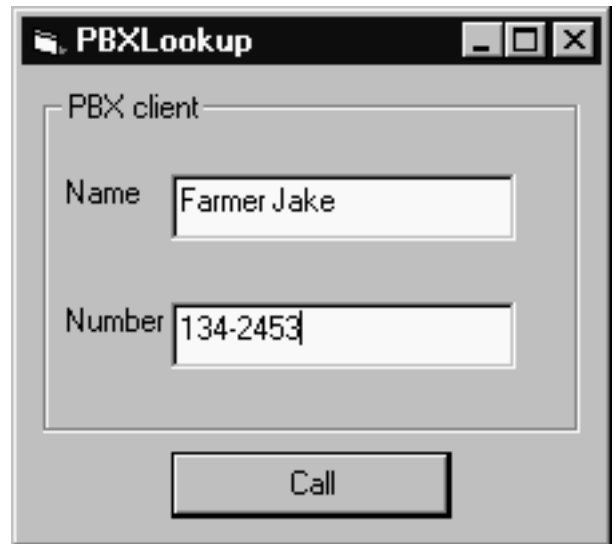
Figure 4: Visual Basic PBX client

We understand that work is in progress on a COM interface for Standard ML of New Jersey.