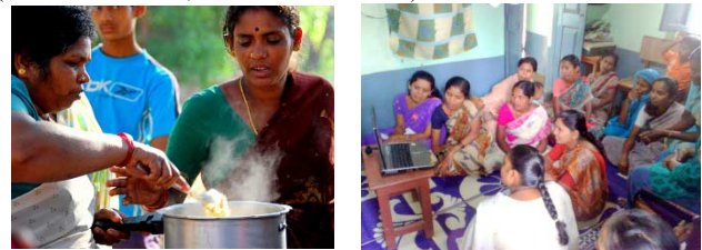
Figure 1: (Left) a screen shot from the cooking video and (right) a screening session in Jakkur.

Dissemination and call-in contest: A screening session was held in each community, where we screened videos on a local television or on our laptop (figure 1, right). Group sizes varied from 6-14 members. Videos were paused for recall and retention exercises. At the end of each session, VCDs containing the videos were distributed to attendees (1-3 VCDs each, chosen at random).