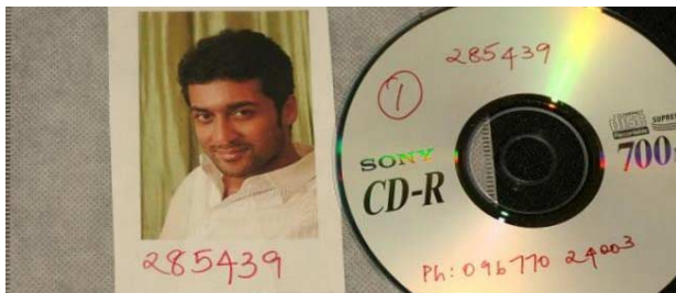
Figure 2: Example VCD and sleeve

In summary, physical media featuring development content were created, a mobile call-in contest with a questionnaire was arranged, a clear incentive was marked off for each person in the chain, and an initial meeting was conducted to describe the contest and disseminate the media.