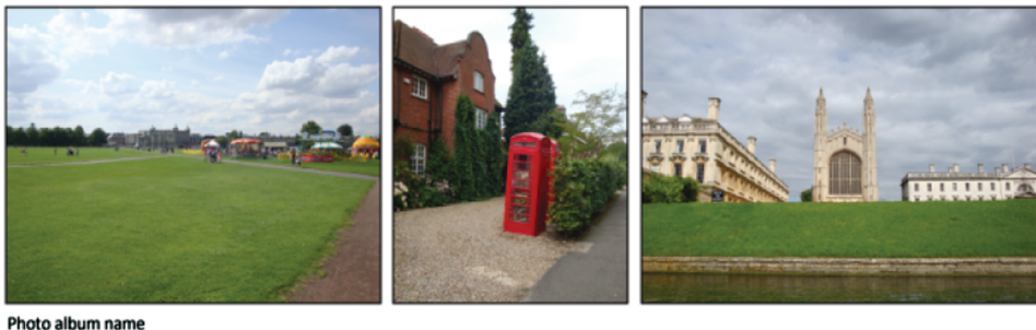
FIGURE 2. A photostrip. (Color figure available online.)

Above each display are embedded IR proximity sensors (Figure 1b). Bringing a hand close to the sensors triggers a push-to-share function. The most predominantly visible photograph on the display corresponding to the triggered proximity sensor is zoomed to fill all four screens. Bringing the hand toward the sensor again will then