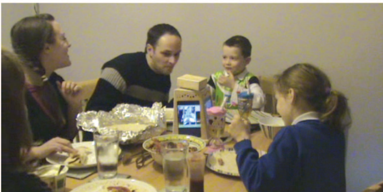
FIGURE 3. Display of affection by mother. (Color figure available online.)

A number of things are taking place here. First, the parents validate OW's role as presenter through acknowledging glances at the display. The mother also uses the memento as an opportunistic display of affection to OW as she smiles at him and tells him how she loves the photograph—an expression of how much she loves him. We see too how the memento is used by OW to draw attention to himself from guest