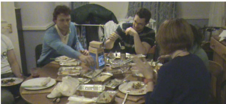
FIGURE 4. Serving food and interacting in synchrony. (Color figure available online.)