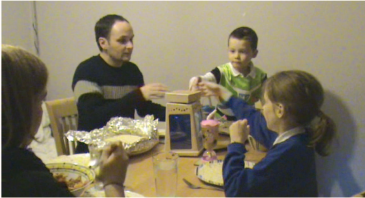
FIGURE 5. Managing interaction conflicts among children. (Color figure available online.)

I spin it?"; the father tells her to "Go for it." As she reaches to spin the device, the young son stands on his chair and simultaneously reaches over to spin the device. The father, noticing this, moves his arm in an attempt to block OW's hand and says, "Hang on, hang on. Oi oi" (see Figure 5).