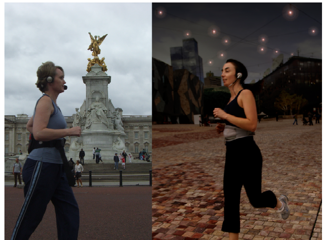
Fig. 1. Jogging over a Distance between London, UK, and Melbourne, Australia.

Exertion Interface, whole-body interaction, exergame, exergaming, audio, spatialization, sports, running, mobile phone, heart rate, physiological data.