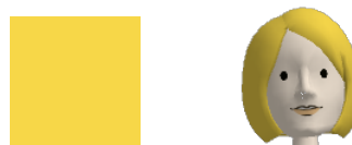
Figure 1: Example of MTurk Task 2. Task 1 is the same except that only a swatch is given.

The design that we suggested has a minor limitation in that a color swatch may display differently on different monitors. However, we hope to overcome this issue by collecting 50 annotations per RGB value. The example color \xrightarrow{e} emotion \xrightarrow{c} concept associations produced by different annotators a_i are shown below: