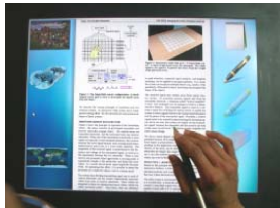
Figure 2: A screenshot of the shared workspace UI. Far left, the media items that can be opened. Far right, controls for switching between pen, highlighter and eraser, and starting a whiteboard session. A selected document is reviewed & annotated in the middle.

As shown in Figure 2, the tablet screen provides a window onto a large digital workspace, which is shared across the network with other connected C-Slates. Within the workspace, media items such as images, video, web pages and documents can be opened, reviewed and annotated.