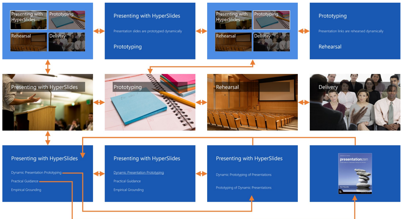
Figure 2. Example slides and navigation paths of a HyperSlides presentation in the default visual style

{A new way to think about presentations} ⌘ opening verbal introduction [Presenting with HyperSlides < Presenting.jpg] ⌘ title and image of scene 1 [> Dynamic Presentation Prototyping] [>> Dynamic Prototyping of Presentations] [>> Prototyping of Dynamic Presentations] [> Practical Guidance > PresentationZen.jpg] [> Empirical Grounding >> GroundedTheoryStudy.docx] ⌘ hyperlinked bullets, slides, and files of scene 1 {Presentation slides are prototyped dynamically} ⌘ verbal transition to scene 2 [Authoring < Prototyping.jpg] [> Setting Goals given Constraints] [> Telling Stories with Slides] [> Planning with Points] [> Styling as a Service] [> Linking between Scenes] {Presentation links are rehearsed dynamically} [Rehearsal < Rehearsing.jpg] [> Preparing for Structured Spontaneity] [> Linking between Scenes] [> Expanding on Demand (to learn the story)] {Presentation itself is delivered dynamically} [Delivery < Delivering.jpg] [> Orchestrating Focus and Flow] [> Influencing Audience with Timing] [> Expanding on Demand (to tell the story)] {Rapid iterative prototyping of flexible presentations} ⌘ closing verbal takeaway message