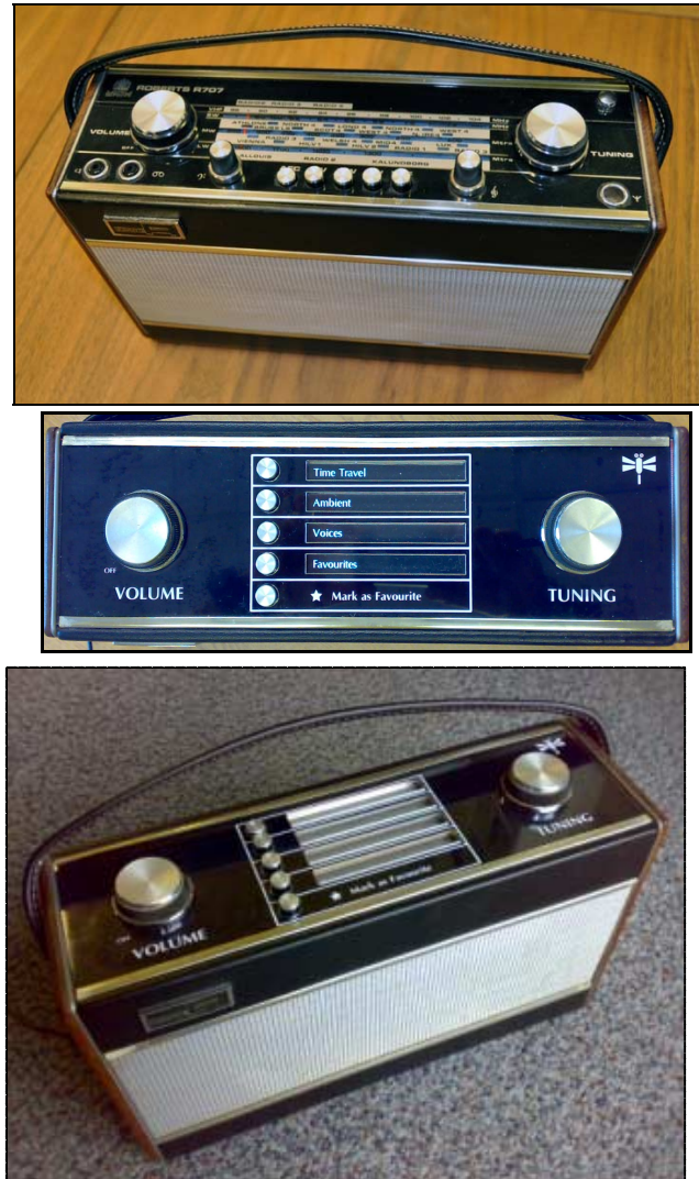
Figure 2. The original Roberts R707 (top); the redesigned FM Radio (bottom) and its interface (middle).

sound in the channel. When the FM Radio is turned off, or the channel is changed, playback of the current channel stops: when the radio is turned back on or the channel is re-selected, the play resumes from its previous position.