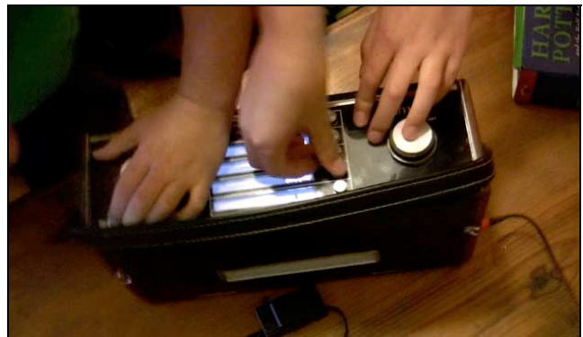
Fig. 1 Three siblings interacting with the Family Memory Radio.

We address these problems with digital mementos by exploring a new design approach. Rather than leaving digital mementos 'imprisoned' in a computer, we explore ways that digital collections can be made more accessible, interesting and better integrated into people's everyday lives. Our new designs also need to fit seamlessly into the home by appropriating familiar objects and metaphors. We explore the concept of embodied digital mementos of 'sonic souvenirs', family recordings taken during summer holidays. Our design allows these to be accessed through a familiar domestic object: a radio (Fig. 1). We shed light on the motivation, design and evaluation of devices for personal digital mementos, by studying how digital sound can engender and enhance collective family reminiscing.