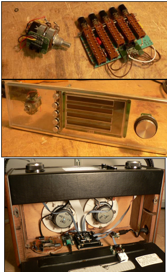
Figure 4. The digitally-enhanced original radio controls (top), the replacement control panel assembly (middle), and the assembled FM Radio (bottom)

unaware of what we had designed: we mentioned they would be asked to try out “a device” and provide some feedback. This intentional “secrecy” allowed us to capture initial impressions about the Radio and how participants first related to it.