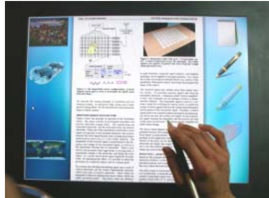
Figure 2: A screenshot of the shared workspace UI. Far left, the media items that can be opened. Far right, controls for switching between pen, highlighter and eraser, and starting a whiteboard session. A selected document is reviewed & annotated in the middle.

As shown in Figure 2, the tablet screen provides a window onto a large digital workspace, which is shared across the network with other connected C-Slates. Within the workspace, media items such as images, video, web pages and documents can be opened, reviewed and annotated.