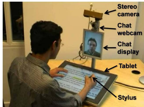
Figure 1: The C-Slate hardware setup comprising of a top-down stereo camera attached to a large tablet workspace, with a video conferencing display at eye-level to the user.

These physical interactions form important visual cues for collaboration, providing awareness of other peoples' actions and intentions, and facilitating fine grained coordination amongst members of the group. These interactions are clearly lost when we move to the remote case, and are often overlooked by current CSCW and groupware tools such as video and audio conferencing or remote desktop systems.