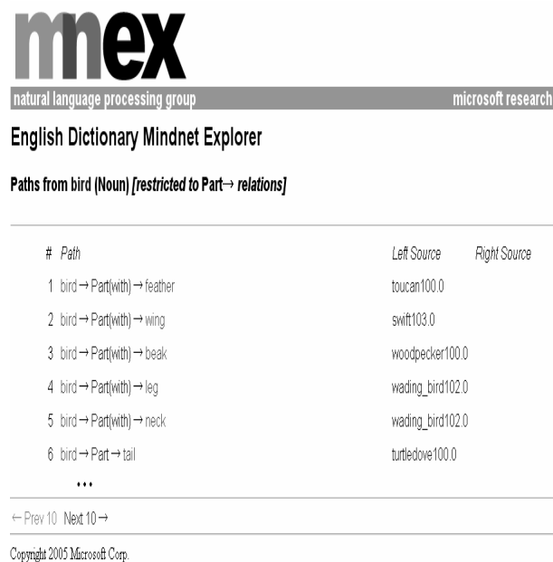
Figure 2: MNEX output for “bird (Noun) Part” query

user enters. A path is a set of links that connect one word to another within either a single semrel structure or by combining fragments from multiple semrel structures. Paths are weighted for comparison (Richardson, 1997). Currently, either one or two words can be specified and we allow some restrictions to refine the path search. A user can restrict the intended part of speech of the words entered, and/or the user can restrict the paths to include only the specified relation. When two words are provided, the UI returns a list of the highest ranked paths between those two words. When only one word is given, then all paths from that word are ranked and displayed. Figure 2 shows the MNEX interface, and a query requesting all paths from the word bird , restricted to Noun part of speech, through the Part relation: