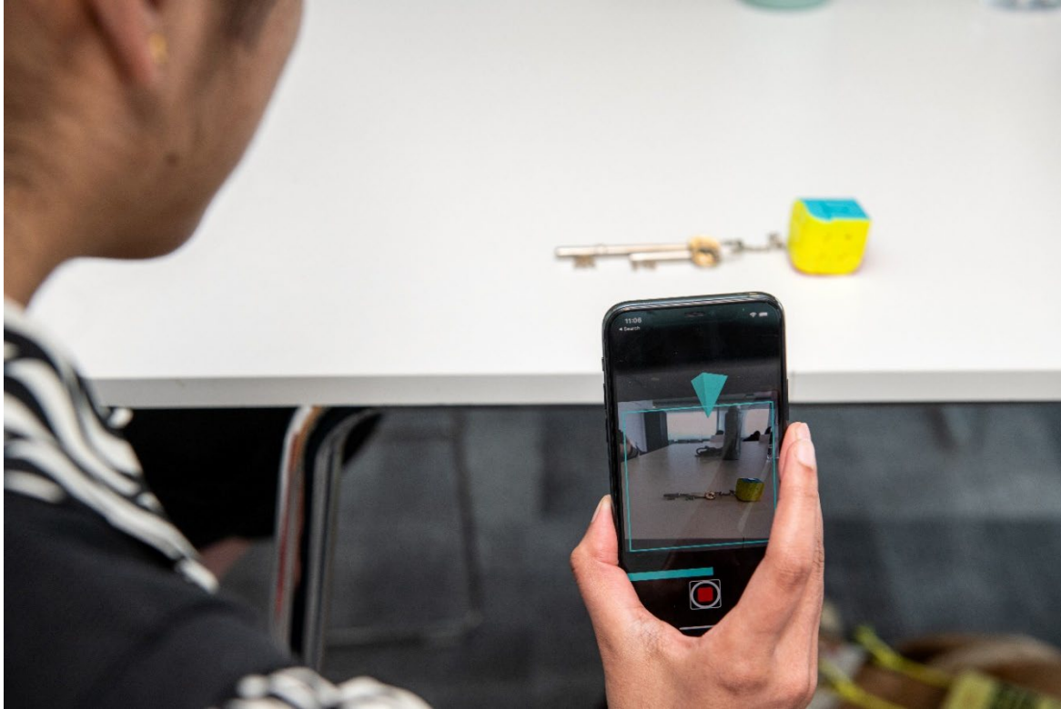
Figure 1: A user finds a set of keys with Find My Things, having previously taught the keys to the app through providing four videos.