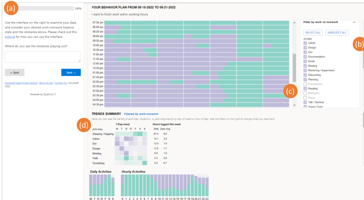
Figure 2: Reflection Tool Interface. (a) IIMC instructions were given on the left. (b) Participants could choose one of work vs. nonwork, activity, location, or plan alignment filters to get different views of their data. (c) The calendar in the middle displayed data of interest across days of the week and times of day. In work vs. nonwork view, purple represents work while green represents nonwork. Slots are split into purple and green halves if activities of both types were reported in them. (d) The tool displays different summary information below the calendar. These include total and average reported hours, distribution of time spent on activities each day (the longer the time, the darker the day under ‘7-Day trend’), across the week (the ‘Daily Activities’), and across the day (the ‘Hourly Activities’). Observe that both calendar and Hourly Activities show work hours typically start between 8-9 am on workdays.

longer the time, the darker the color), (2) a daily activity graph showing activity breakdown on each weekday, and (3) an hourly activity graph showing activity breakdown over different times of the day. Drawing from past work on reflection design patterns [3], we included different data views in calendar and aggregate forms to help users explore how and where they spend their time, subsequently examine if their current behaviors matched their desired behaviors, and explore mismatches as well as opportunities to address them. An example task that could be achieved using the interface was to check working days and hours by either examining the distribution of purple slots over the calendar or reviewing daily and hourly breakdowns (i.e., larger purple segments appear on workdays and during work hours). This could quickly reveal if work is happening on undesired times and days.