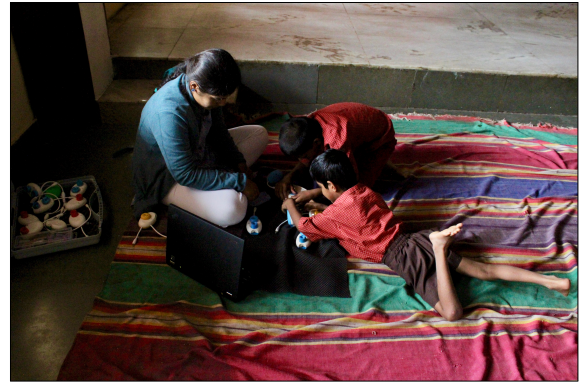
Figure 2: Children intensely at play

We find that children struggled and had frustrations with the devices as they didn't always work in ways expected, but also expressed joy at accidental discoveries that involved some stimulus such as sounds playing. In the Evaluation Section, we use the diary entries and observations to identify vignettes that convey the acquisition of the target skills during play.