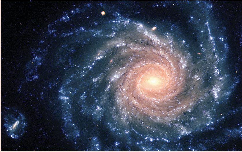
Figure 1. How secure is your JPEG parser?

fective in finding security vulnerabilities, often missed by static program analysis and manual code inspection. In fact, fuzzing is so effective that it is now becoming standard in commercial software development processes. For instance, the Microsoft Security Development Lifecycle 21 requires fuzzing at every untrusted interface of every product. To satisfy this requirement, much expertise and tools have been developed since around 2000.