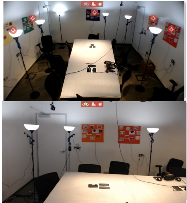
Figure 2. We demonstrated ICC using a meeting room outfitted with 11 webcams (top). Different perspectives of the room (bottom) could be viewed by selecting hotspots (the red circles in the top image) in the web app.

Infrastructure Camera Control (ICC) allows a smartphone user to access, control, and capture images from cameras located at a specific location, such as an amusement park, public square, or the user's home. ICC was inspired by survey respondents who mentioned difficulties controlling their phone and navigating inaccessible environments; our probe aims to give people with motor impairments opportunities to capture photos from perspectives or vantage points that may not have been accessible to them. Once a user has gained access to the network of cameras, the user can alternate between different cameras to find the desired view. The user can also tilt and pan the camera, as well as zoom in and out. When the user captures a photograph, it will be stored directly on the user's phone.