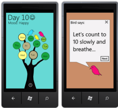
Fig. 1. EmoTree Mobile Phone Application. Main Page (A) and Intervention Page (B)

As usage continues, the user may assess overall progress or history by selecting the history icon at the bottom of the tree. Inspiration for the interface design came from the notion of tending a garden and using that as a metaphor to visually guide users to make better choices [1]. Since the application was designed for long-term use, the idea of a tree that gradually grows based on your daily health decisions served best as a visual guidance system that could invoke encouragement: the healthier your choices, the healthier the tree.