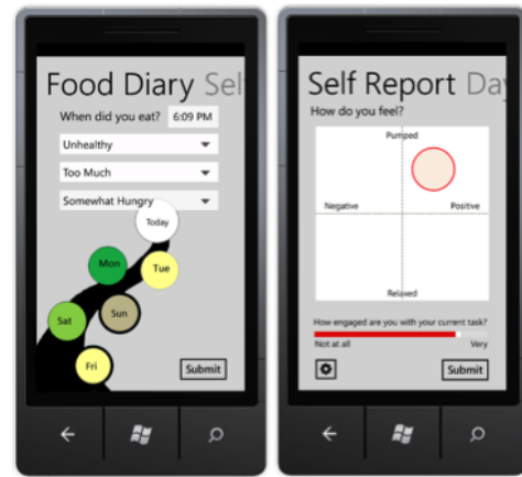
Fig. 2. EmoTree Mobile Phone Application. Nutrition Log (A) and Self-Report Tool (B)

In Study 1, we conducted a user study (N=12, 2 males) to investigate emotional eating patterns using EmoTree. In recruitment, all participants self-identified as emotional eaters.