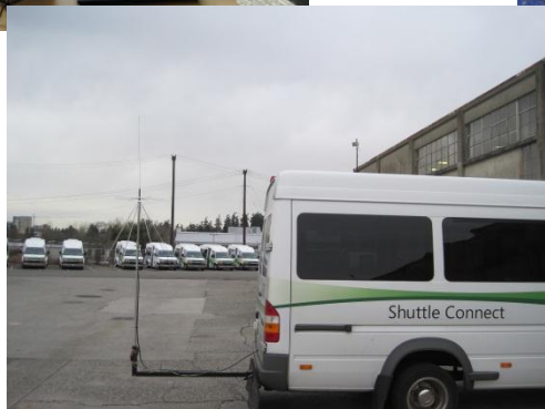
WS Antenna on MS Shuttle