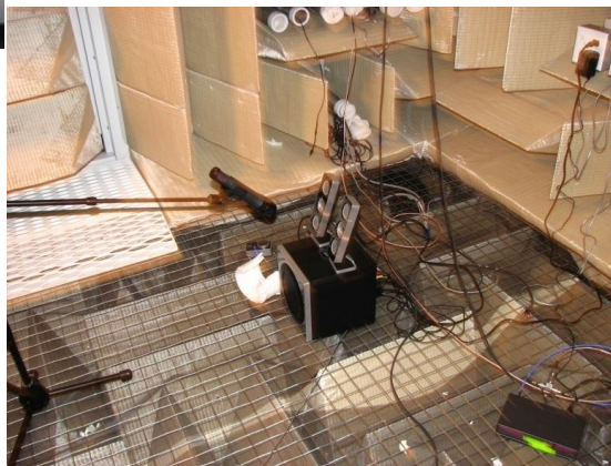
Microphone testing in Anechoic Chamber