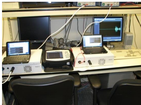
Subcarrier Suppression demo